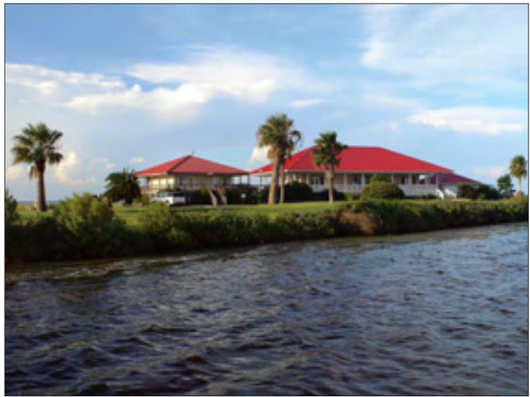
REDFISH LODGE ON COPANO BAY

immerse themselves in the natural beauty of the resort and observe shore birds, including spoonbills and herons. They can visit the beach; practice their skills on the putting greens; or head into Rockport's art museums and shops. Nearby Aransas National Wildlife Refuge, which is the winter home to the whooping crane, also offers a great opportunity