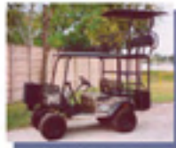
Bad Boy Buggy