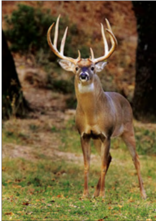
COUNTRY LIVING: Hunters account for a large share of recreational land buyers. Other interests range from fishing and weekend ranching to wildlife photography and hiking.

Many head for the country to enjoy favorite pastime