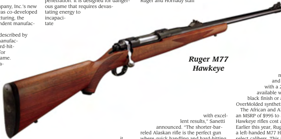
Ruger M77 Hawkeye

For more information on the Ruger M77 Hawkeye rifles or for dealers, visit www.ruger.com . To learn more about the .375 Ruger cartridge, you can go to www.hornaday.com or visit Ruger at Booth 585 at the Dallas Safari Club 2008 Sporting Convention and Expo.