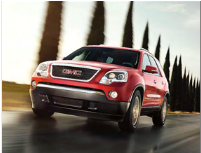
2008 GMC Acadia

• The Intelligent AWD system. It delivers enhanced driving dynamics and a more refined driving experience. The system takes AWD performance to the next level by incorporating dynamic yaw control and fully integrating with the StabiliTrak electronic stability control system. A target vehicle yaw rate is established based on driver inputs and driving conditions. Intelligent