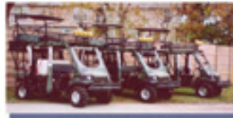
Kawasaki Mule Transport