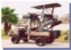
Kawasaki Mule Transport

Tops-N-Towers is the largest custom marine fabricator on the western Gulf of Mexico. Also, in recent years we have become the leader in custom hunting conversions. We use the same schedule 40 Aluminum pipe in our hunting trucks as we do in all of our Marine applications. Using light weight Aluminum instead of heavy steel allows your vehicle to carry more people and equipment. It also keeps the center of gravity lower without the heavy steel up high. We build rear bench seat systems with an oversized storage basket and marine grade vinyl cushions with high density foam. Other items include shooting rails, standing areas with heavy duty grating, front and rear bumper/basket systems, full cab enclosures, roof storage systems, body decaling, weld on drink holders and our ever popular rubber coated clamp on removable drink holders, and much more. All of the aluminum is rubber coated with heavy duty speed liner to reduce glare and extend the life of an already non-corrosive structure. Decaling, enclosures, and cushions are available in a variety of camouflage patterns from basic black, green, and tan, to Advantage and Real Tree patterns. Bird hunters are using the optional dog box and water tank systems for upland bird, quail, and goose hunts allowing guides, dogs, clients, and gear to be carried in one vehicle quietly and safely.